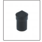
small cone head (included)