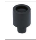
cone cavity head (included)