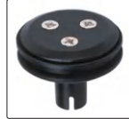
wheel with 0.1m perimeter (included)