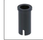
clamping sleeve (included)