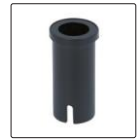
clamping sleeve (included)