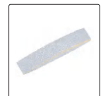
reflection sticker (included)