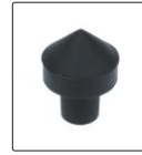
cone head (included)