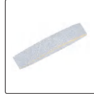
reflection sticker (included)